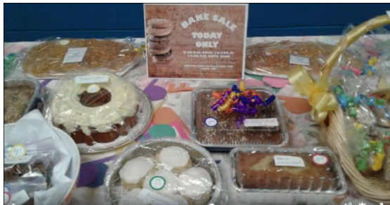
Bake Sale, March 30