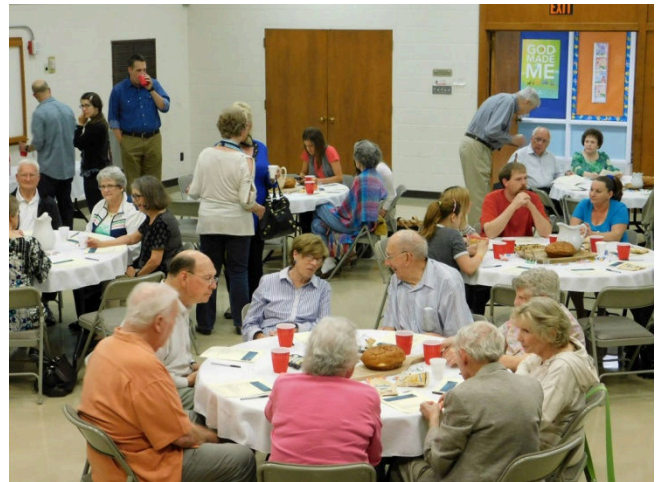
Maundy Thursday, April 13