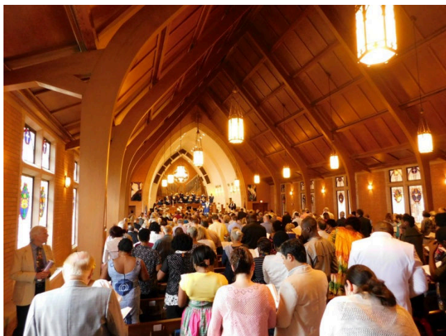
Easter Sunday, April 16