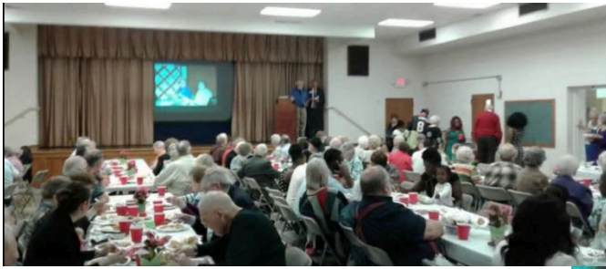
Bazaarnival Luncheon, March 30