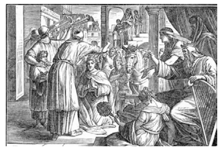
Comments for Contemplation

The King Who Had It All: Solomon 1 Kings 3:1–14; 1 Kings 11:1–13