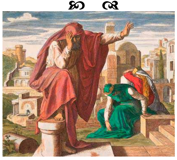
Comments for Contemplation