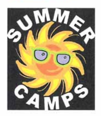
Ages 6 weeks through 3rd Grade