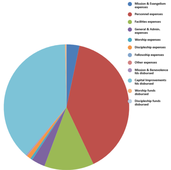
FPCA EXPENSES & FUNDS USED