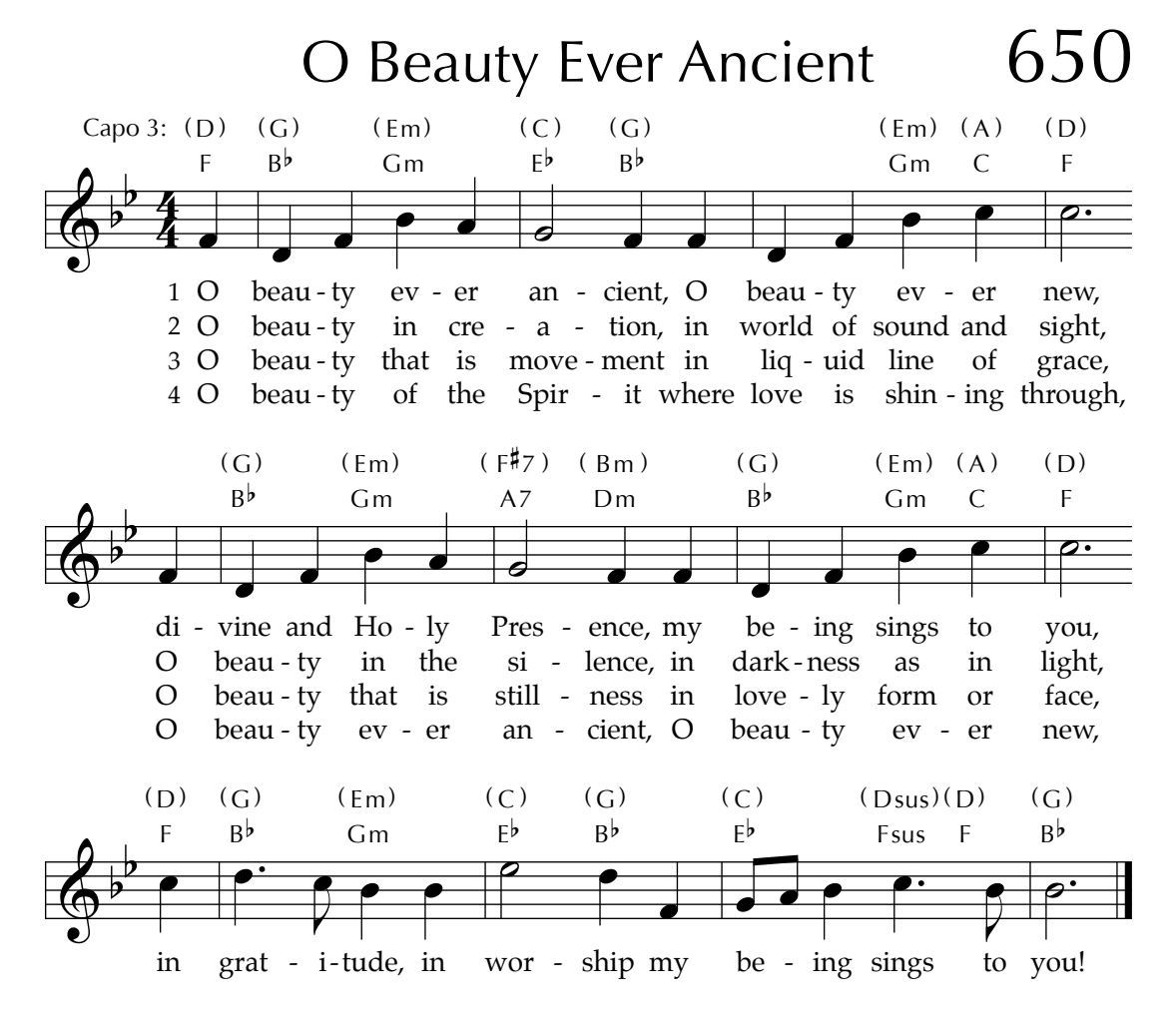
Guitar chords do not correspond with keyboard harmony.

Both Psalms 29:2b and 96:6a encourage us to "worship the Lord in the beauty of holiness," yet celebrating the beauty of the holy God is not an end in itself but involves a call to oppose unjust ugliness. The beauty that draws us to God also urges us to work for mercy and justice.