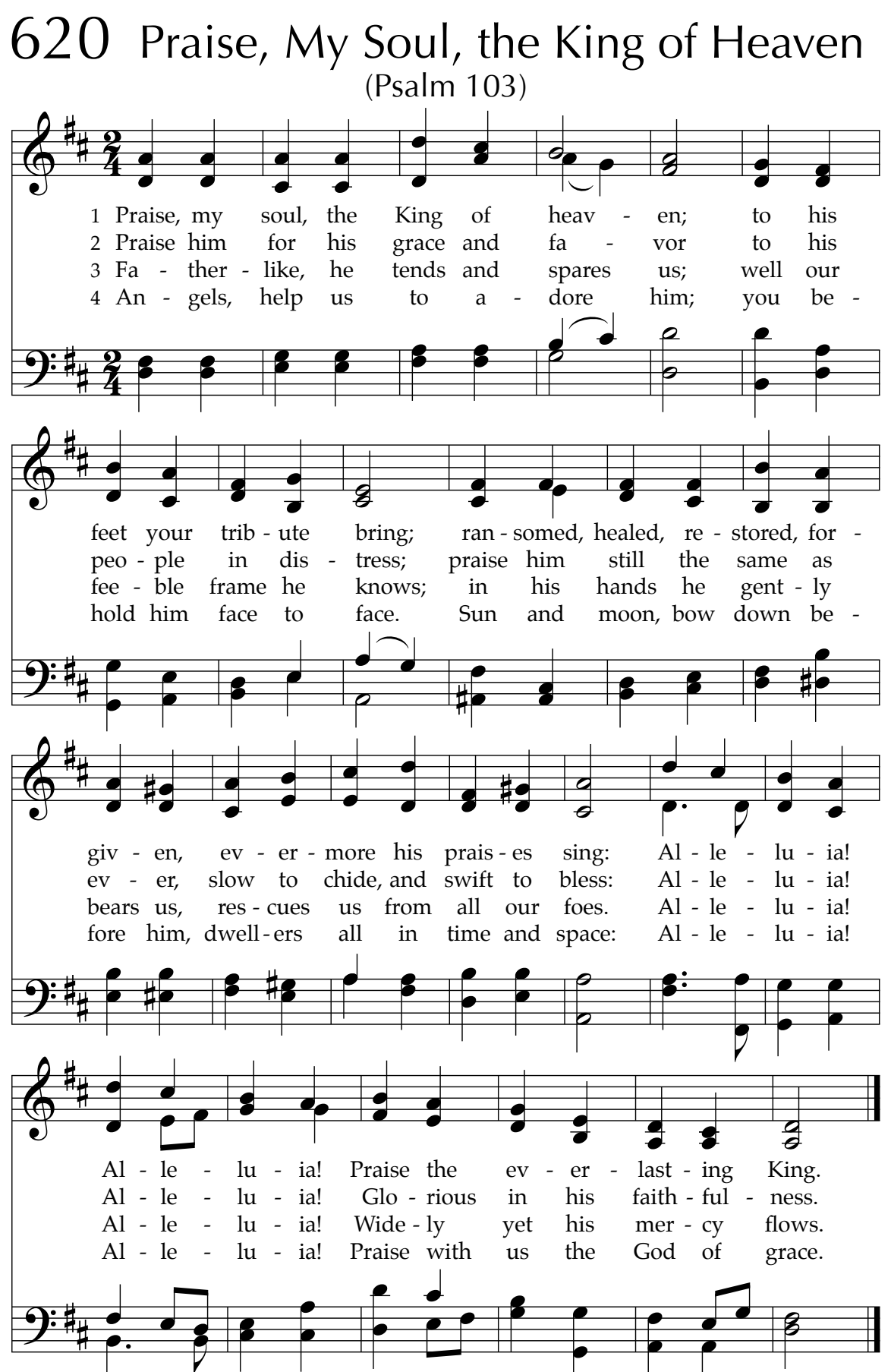
This free paraphrase of Psalm 103 gains much energy and conviction by including the double "Alleluia!" before the final line of text. That repeated four-note figure descending from the tune's highest note gives voice to the praise that the rest of the hymn evokes.