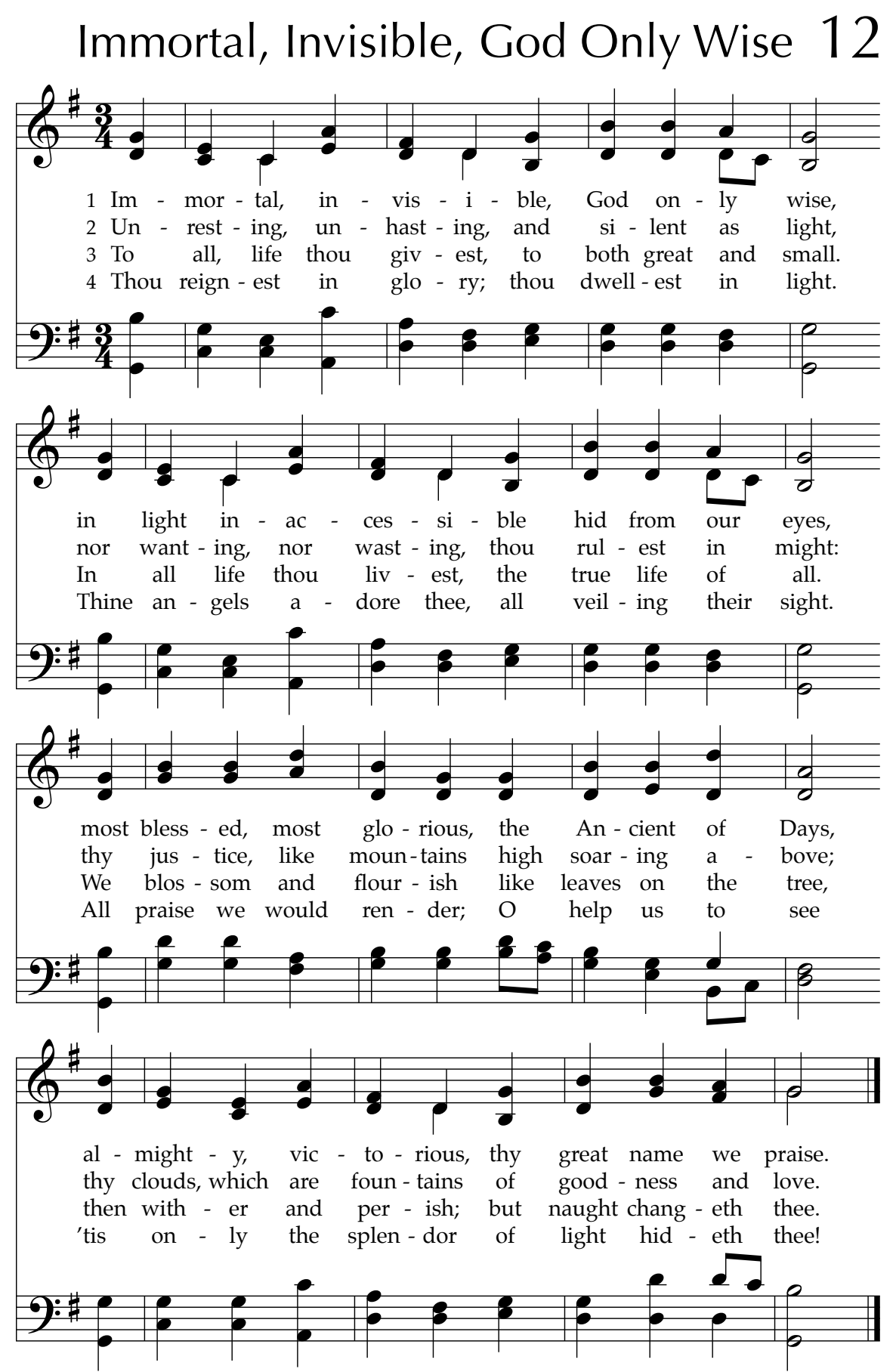
The opening line of this hymn was inspired by the three divine attributes listed in 1 Timothy 1:17 (King James Version), and it continues by considering how God's life exceeds our own finite existence. The text is well set to a Welsh melody shaped by many three-note units.